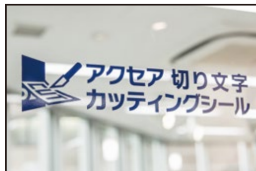
⑧ Use the dust cloth to gently wipe the surface clean of dried detergent.