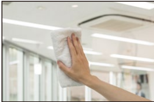
① Clean the surface thoroughly with the dust cloth.