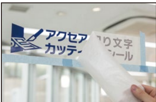
⑦ Peel off the tack sheet.