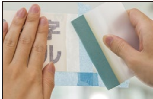
④ Adjust the sheet to the desired position.