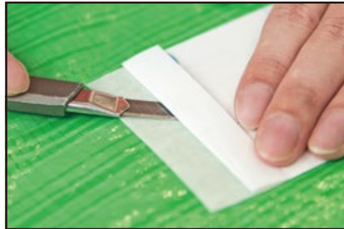
② Spray the surface liberally with the diluted detergent.