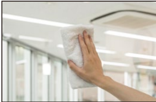
① Clean the surface thoroughly with the dust cloth.