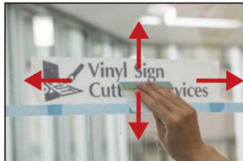
⑤ Continue peeling back the mounting sheet while using the squeegee to firmly affix the adhesive to the surface.