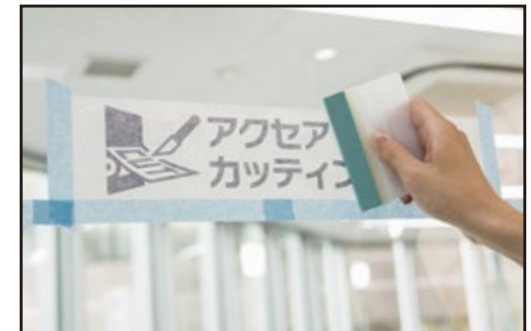
⑥ Rub the surface with the squeegee until all the water is completely removed from under the vinyl letters.