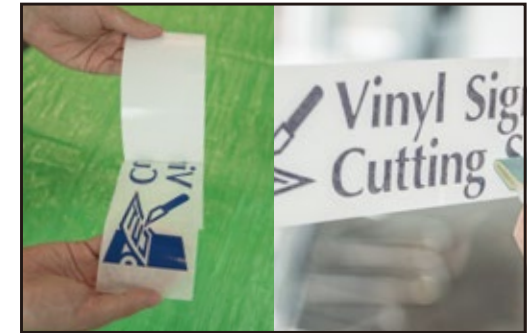
③ Use the ruler and masking tape to mark out the area where the vinyl letters are going to be placed.