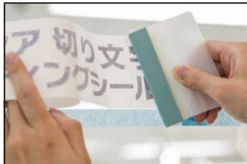
⑤ Start from the middle and work towards the edges, applying pressure with the squeegee to remove the water.