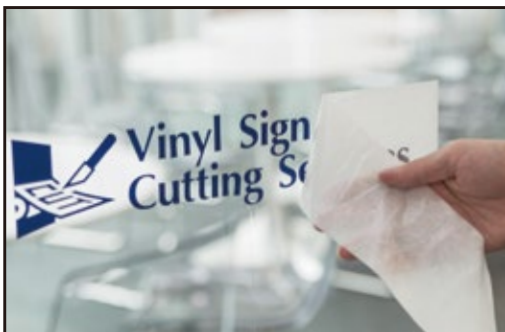
⑦ Peel away the tack sheet.