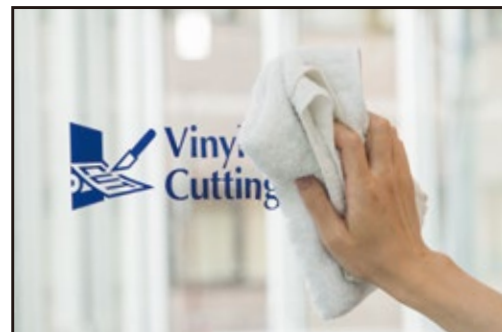
⑧ You're done!