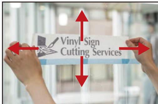
④ Align the sheet to the markings. Peel back the mounting sheet and affix onto surface with the squeegee.