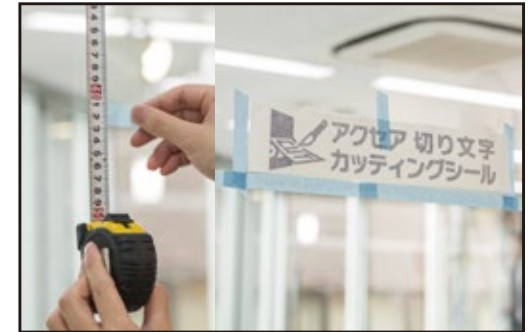
③ Peel off the mounting sheet and use the spray bottle to wet the adhesive side.