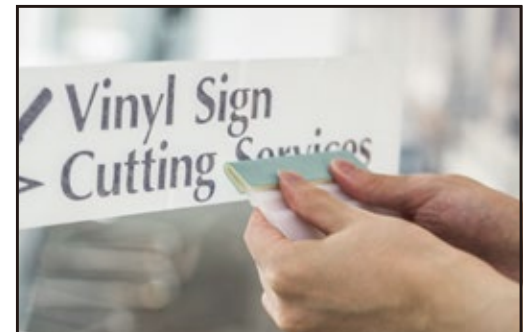
⑥ Make sure to rub firmly to remove air bubbles.